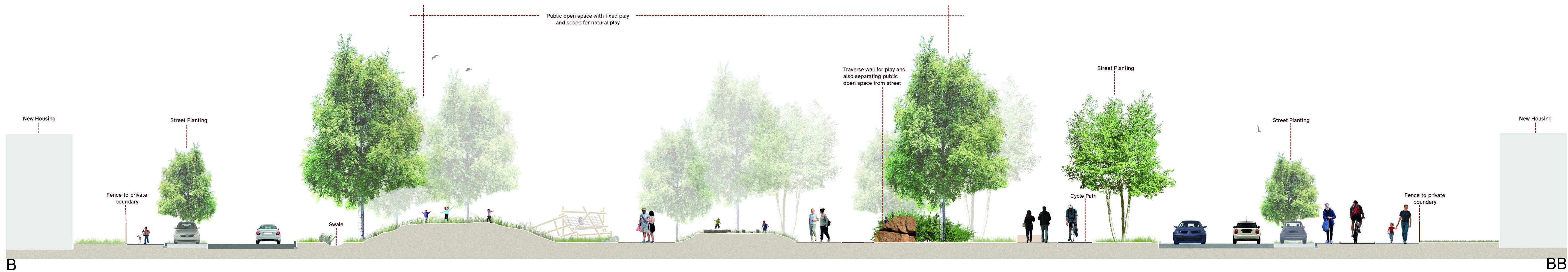
Section B-BB 1:100