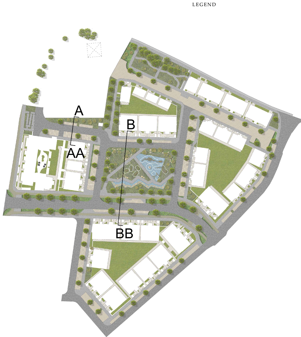
Location Plan 1:1000